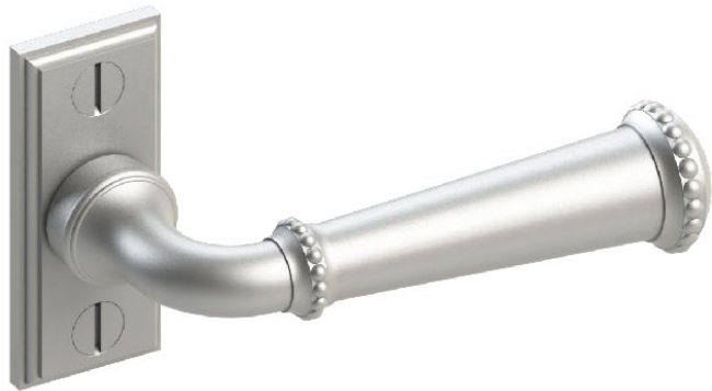
Shown above: 929-WMP-01 Other lever styles also available