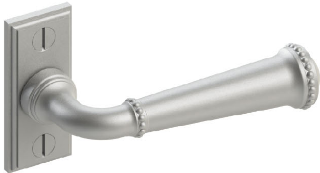
Shown above: 925-WMP-01 Other lever styles also available