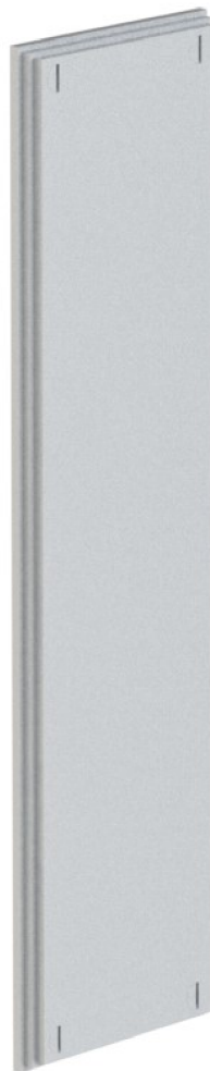
Shown above: 51876 push plate

Please specify lock and knob/lever design