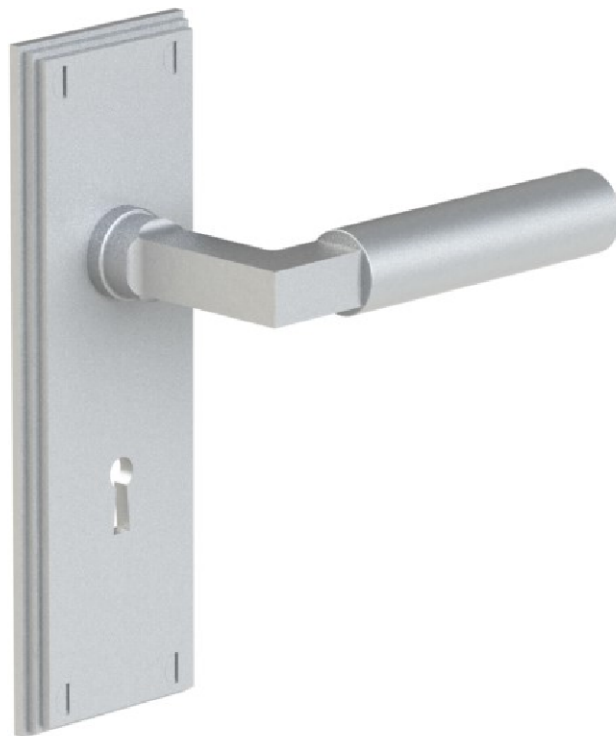
Shown above: 51841 escutcheon plate with 48930 Lever

Please specify lock and knob/lever design