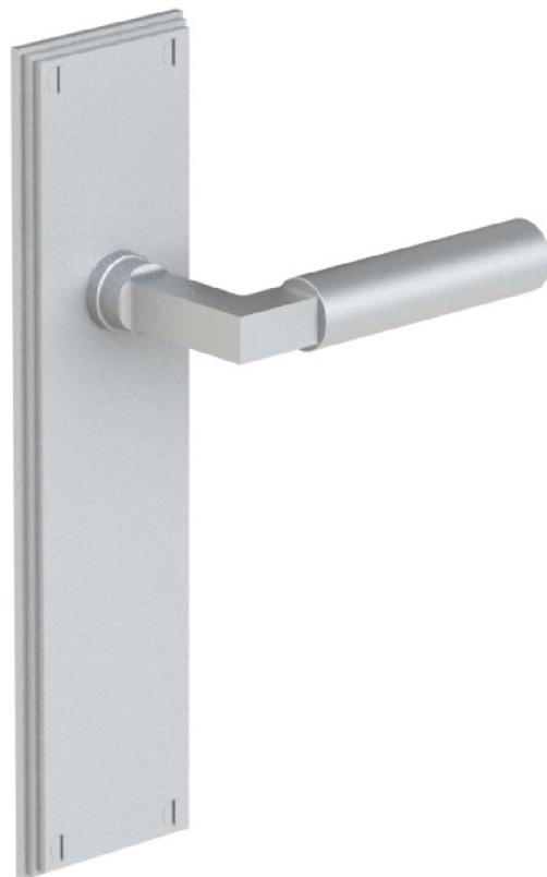
Shown above: 51833 escutcheon plate with 48930 Lever

Please specify lock and knob/lever design