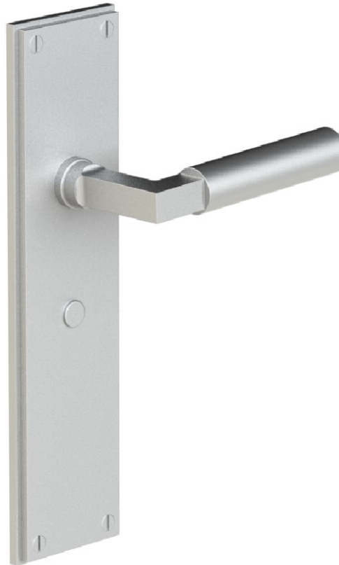
Shown above: 51763 escutcheon plate with 48930 Lever

Please specify lock and knob/lever design