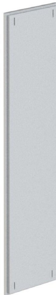
Shown above: 51676 push plate