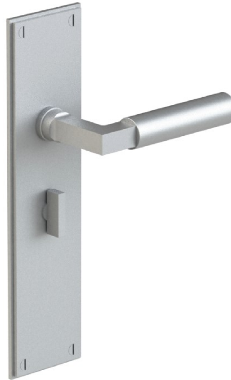
Shown above: 51693 rectangular thumbturn escutcheon plate with 48930 Lever

Please specify lock, knob/lever design, and thumbturn style