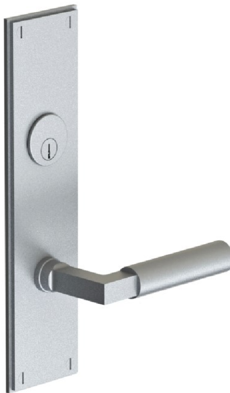
Shown above: 51613 escutcheon plate with 48930 Lever

Please specify lock and knob/lever design