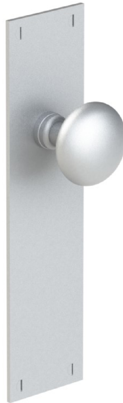
Shown above: 51513 escutcheon plate with 47134 knob

Please specify lock and knob/lever design