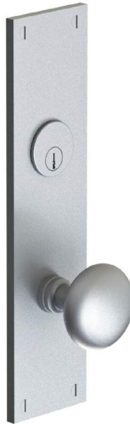
Shown above: 51513 escutcheon plate with 47134 knob

Please specify lock and knob/lever design