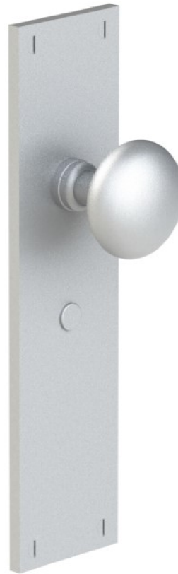
Shown above: 51463 escutcheon plate with 47134 knob

Please specify lock and knob/lever design