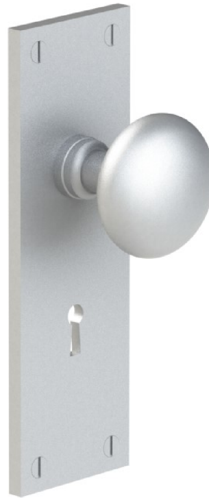
Shown above: 51441 escutcheon plate with 47134 knob

Please specify lock and knob/lever design