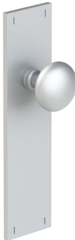
Shown above: 51433 escutcheon plate with 47134 knob

Please specify lock and knob/lever design