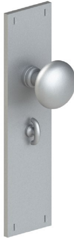
Shown above: 51423 crescent thumbturn escutcheon plate with 47134 knob

Please specify lock, knob/lever design, and thumbturn style