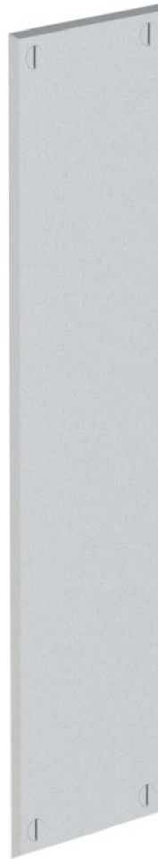
Shown above: 51376 push plate