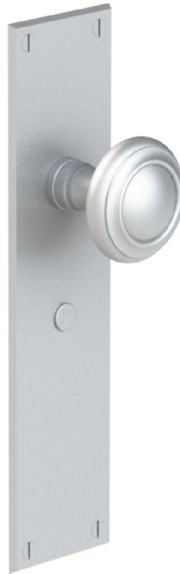
Shown above: 51363 escutcheon plate with 47535 knob

Please specify lock and knob/lever design