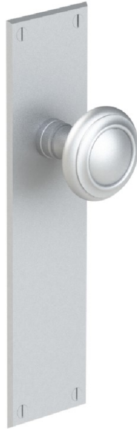
Shown above: 51333 escutcheon plate with 47535 knob

Please specify lock and knob/lever design