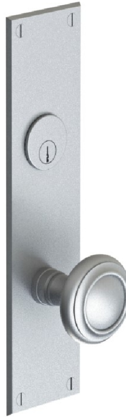
Shown above: 51313 escutcheon plate with 47535 knob

Please specify lock and knob/lever design