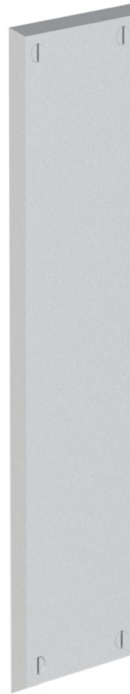
Shown above: 51276 push plate