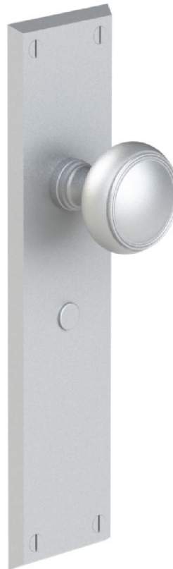
Shown above: 51263 escutcheon plate with 46233 knob

Please specify lock and knob/lever design