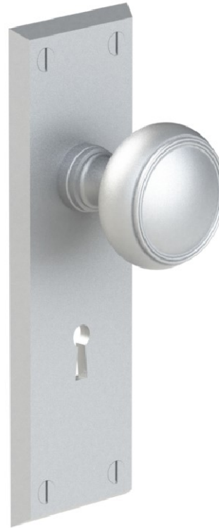
Shown above: 51241 escutcheon plate with 46233 knob

Please specify lock and knob/lever design