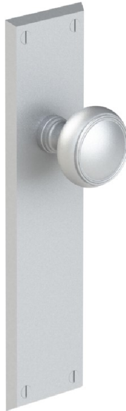
Shown above: 51233 escutcheon plate with 46233 knob

Please specify lock and knob/lever design