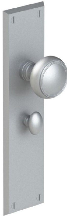
Shown above: 51253 oval thumbturn escutcheon plate with 46233 knob

Please specify lock, knob/lever design, and thumbturn style