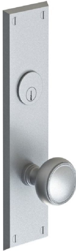
Shown above: 51213 thumbturn escutcheon plate with 46233 knob

Please specify lock and knob/lever design