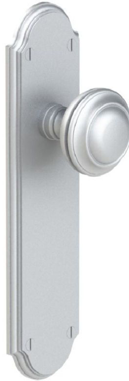
Shown above: 51133 escutcheon plate with 46633 knob

Please specify lock and knob/lever design