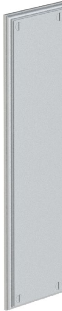
Shown above: 51076 push plate