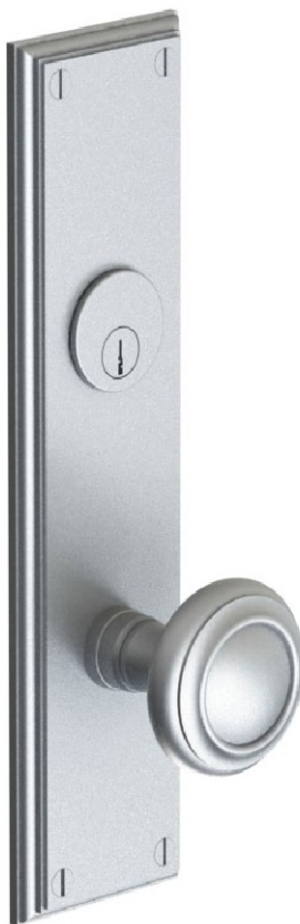
Shown above: 51013 escutcheon plate with 47533 knob

Please specify lock, knob/lever design, and thumbturn style