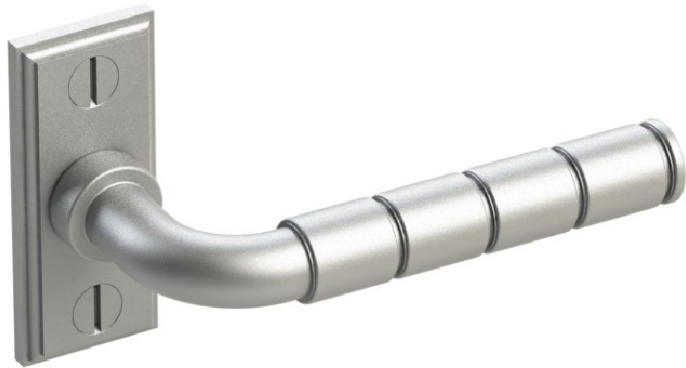
Shown above: 503-WMP-01 Other lever styles also available