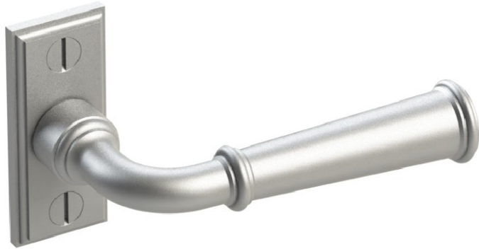
Shown above: 501-WMP-01 Other lever styles also available