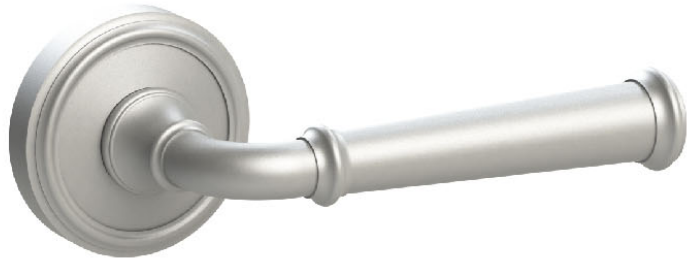
484 Style 1/2" Thick Spring Assist Roses