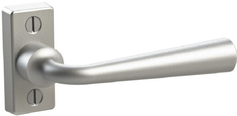
Shown above: 461-TNT-00 Other lever styles also available