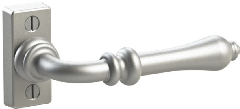
Shown above: 460-TNT-00 Other lever styles also available