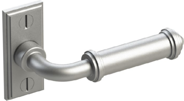
Shown above: 459-WMP-01 Other lever styles also available