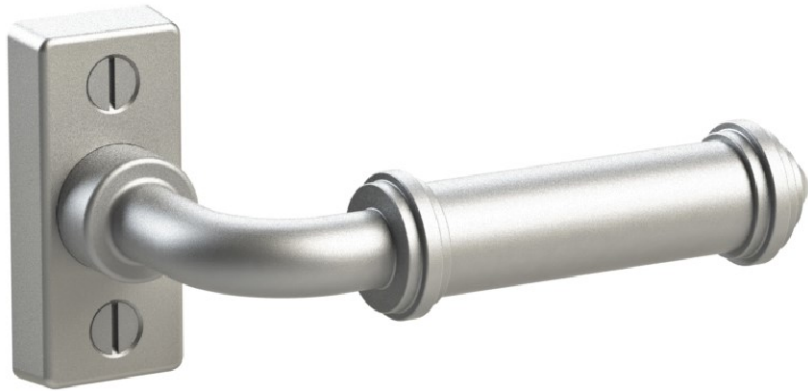
Shown above: 459-TNT-00 Other lever styles also available