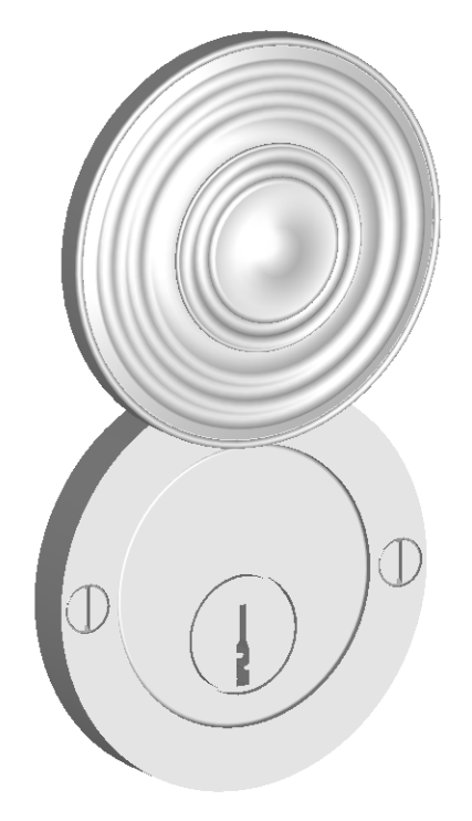
Collar adds 1/8" to required cylinder length